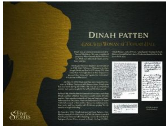
Panel from the "Five Stories" display